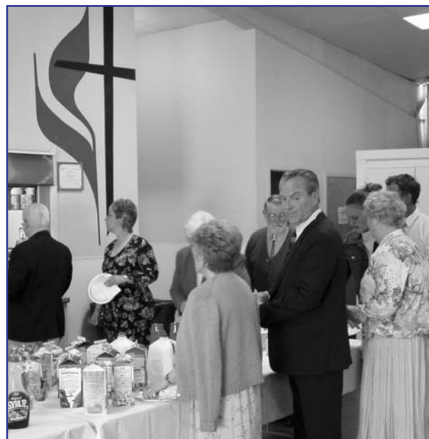
Mothers and families lining up for MYF sponsored brunch