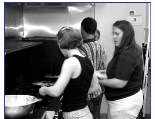
MYF preparing brunch in honor of Mothers