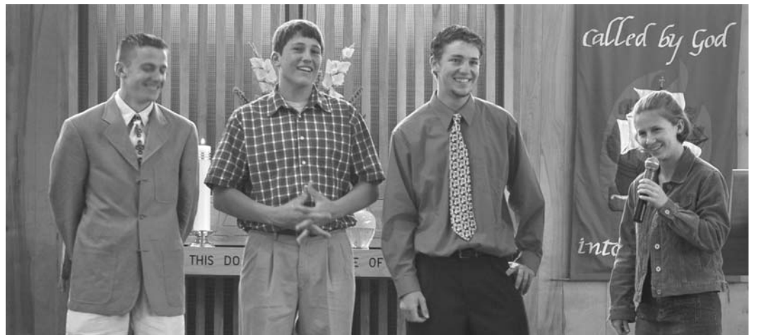
Seniors spoke during church services