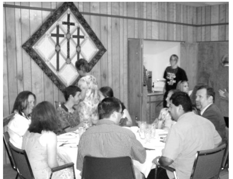
Seniors and families at brunch

Also, the Church Directory will also have several photo pages for us to fill. If you have any church related images (prints, negatives, or digital) you would like to offer for consideration, please deliver them to the church office. Be sure to label with your name any media you wish returned.