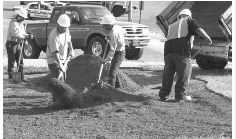
the front Church lawn