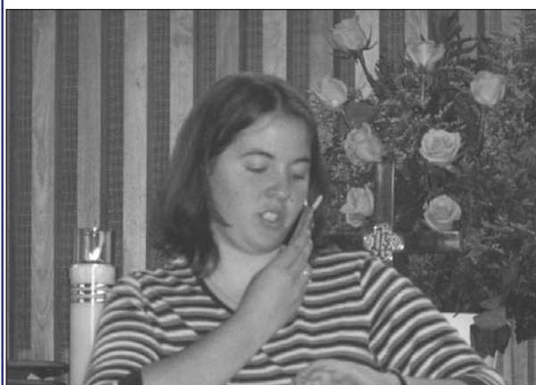
Jesus Is Coming to Dinner Skit