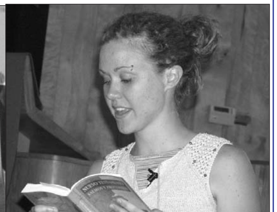
Reading Matthew 25:31-46