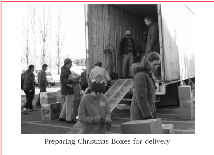
Preparing Christmas Boxes for delivery

The next edition of Visions will be dated January 13.