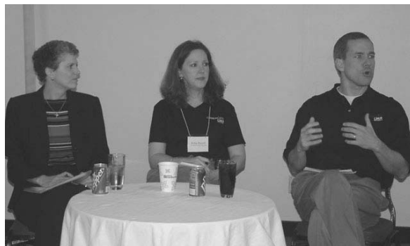
UMR staff members share their knowledge.

Thank you for giving me this opportunity to present the news of FUMC for you and the friends of our church. Any time you would like to contribute an article, share happenings in your life, or give a suggestion please contact me at FUMC 662-6277 or at my e-mail address secretary@lafumc.org .