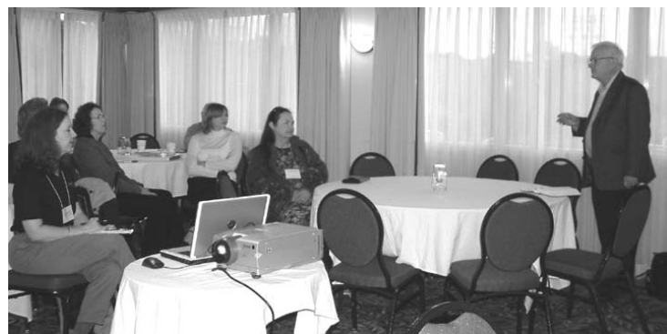
Thursday morning devotions