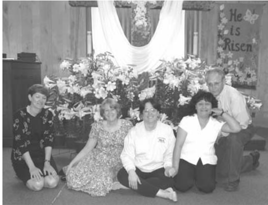
Followed by Easter Egg Hunt