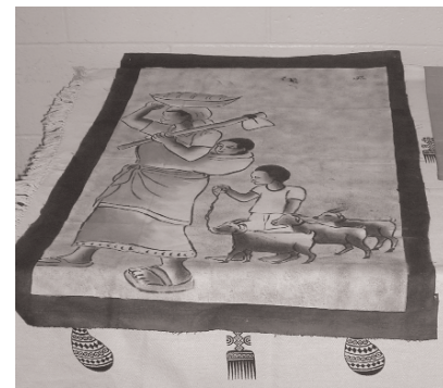
African Art Work displayed at the May/June Birthday Potluck