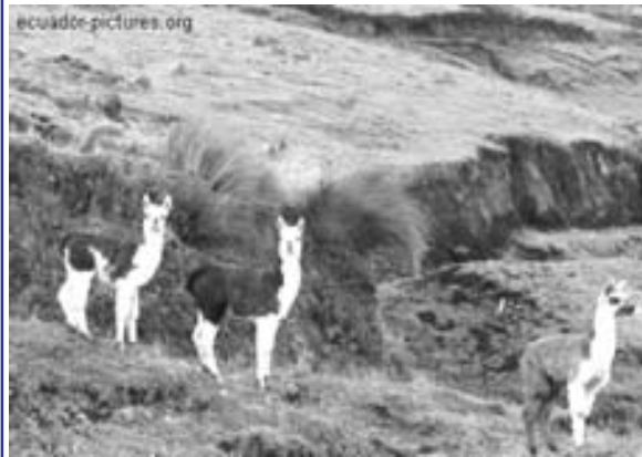
Photos of the Ecuadorian Highlands

Additional Needs: There is a request for a commercial washing machine and dryer for the facility.