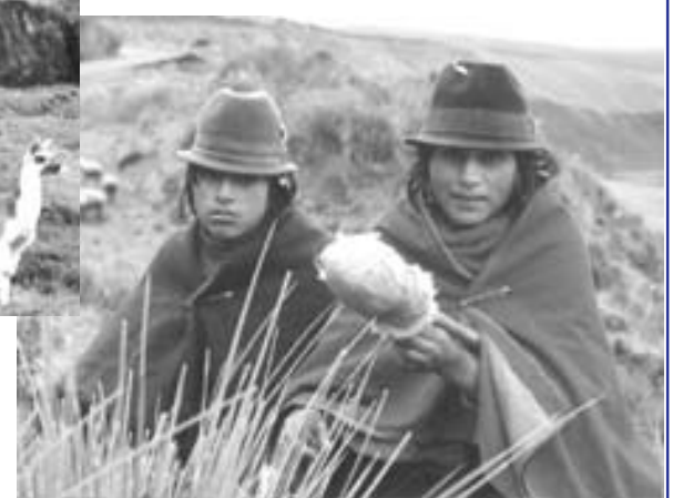
Photos of the Ecuadoran Highlands