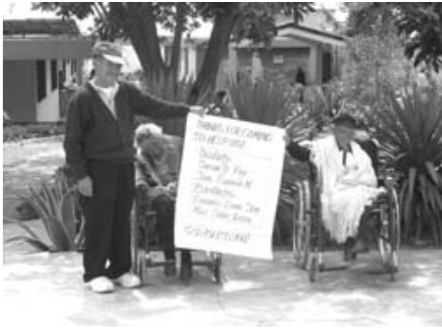
(Above) The whole community of Hogar Betania came out to welcome the Quito Mission Team as they arrived on Friday morning.

Thank you for enabling me and my mission team to take this opportunity to step outside ourselves and our own needs. You gave us the chance to reach out to another people living in a very different world from ours--to touch them with the love of Christ in service, to their needs, to care, and to share the love of Christ.