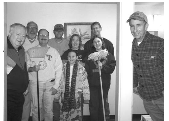
The Way participants drove to Espanola on Saturday, February 3rd, to help with clean up and other tasks at McCurdy School, a Christian school project related to the General Board of Global Ministries of the United Methodist Church, for children from Pre-school through High School ages.