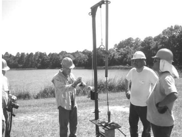
Water well training in Nicaragua

MORE MISSIONS PLANNED THROUGHOUT OUR AREA (see the next column)