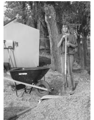
Scouts work to help redo the Ark's play area.