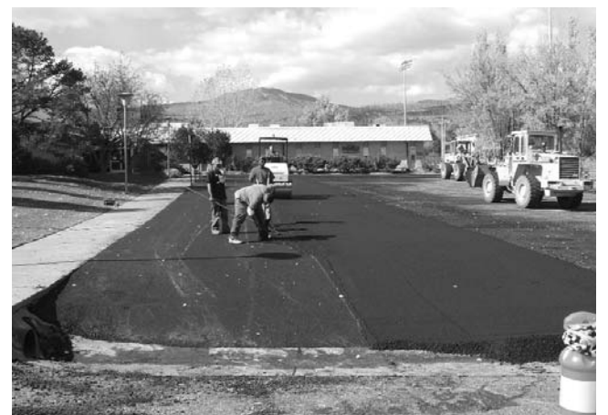
Repaving the parking lot.