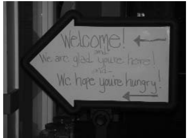
Firemen and Policemen's Holiday Dinner December 8th