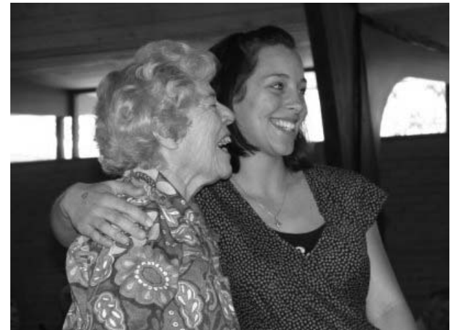
Mothers' Day May 11th