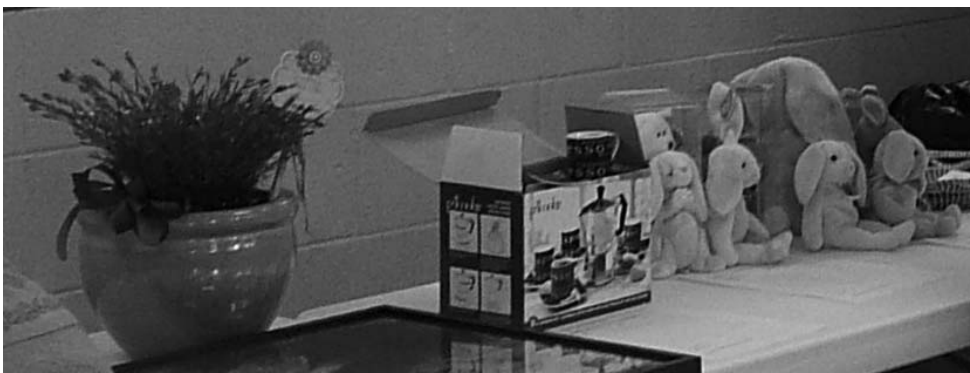
UMW Tea & Silent Auction April 20th