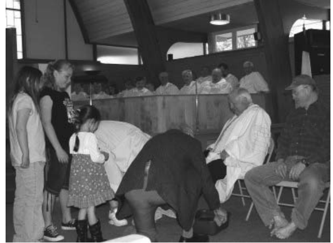
Children's Sermon on Feet Washing

I am committed to seeking guidance from the staff and leadership at LAFUMC, including all of those who have volunteered with the youth in the past. The warmth and open community of this congregation has made an impression on me since I first set foot in First United Methodist, and I'm absolutely honored and thrilled to be spending time with the youth this summer! I look forward to serving His kingdom with you all!