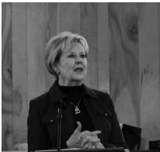
Two faces in the Pulpit