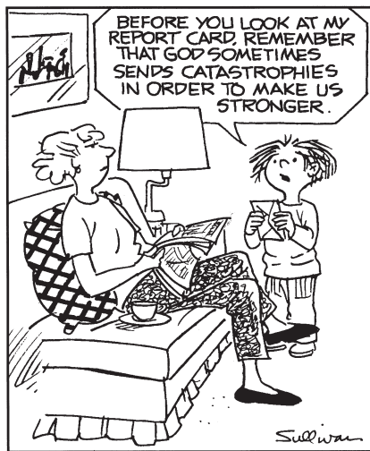
from The Joyful Noiseletter Reprinted with permission