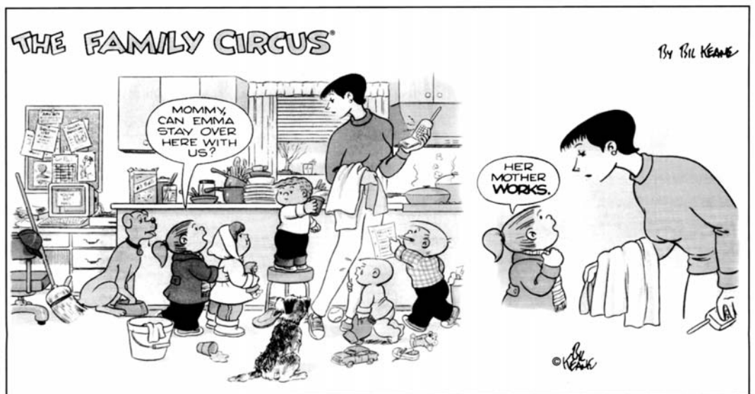
from The Joyful Noiseletter Reprinted with permission of Bil Keane ©Bil Keane